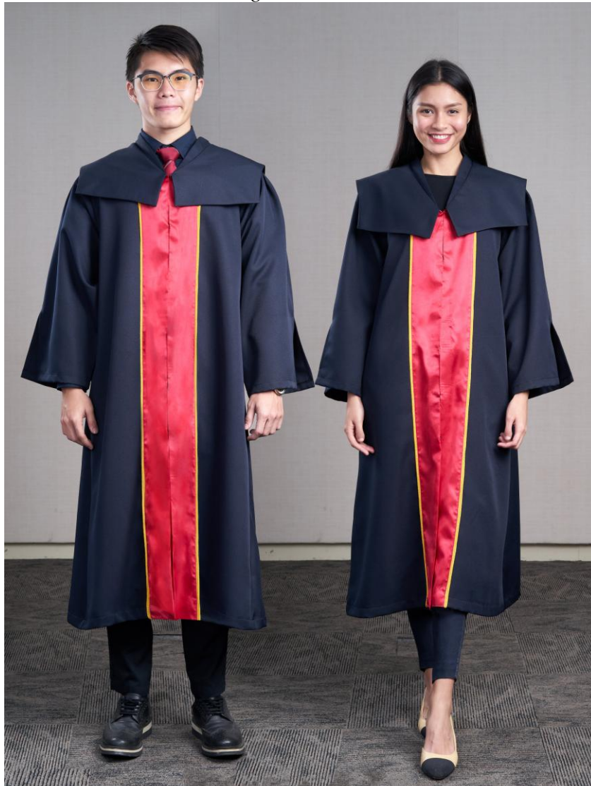
Wearing TP Graduation Attire

*If you are in your military uniform, please note that the graduation attire should not be worn over it.